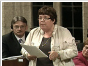
NDP MP Libby Davies presses the Conservative government on the Abdelrazik issue on Thursday, June 4, 2009 in Ottawa.