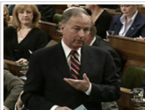
Justice Minister Rob Nicholson speaks during question period on Thursday, June 4, 2009.

Embassy staff have been providing him with food and he is sleeping on a cot in the building's gym.